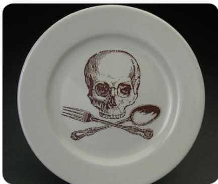
FOLDED PIGS • FOLDEDPIGS.ETSY.COM Repurposed restaurant ware.