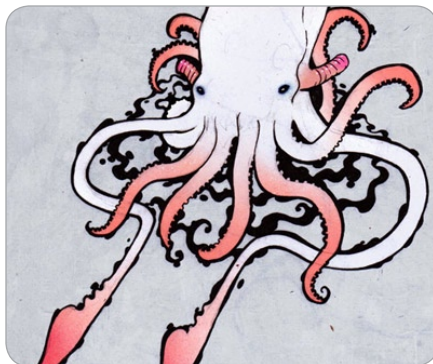
STUNTKID • STUNTKID.COM Illustration and photography by Jason Levesque.