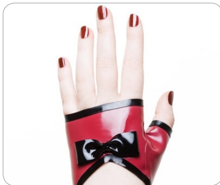
HMS LATEX • HMSLATEX.ETSY.COM Custom-made latex clothing.