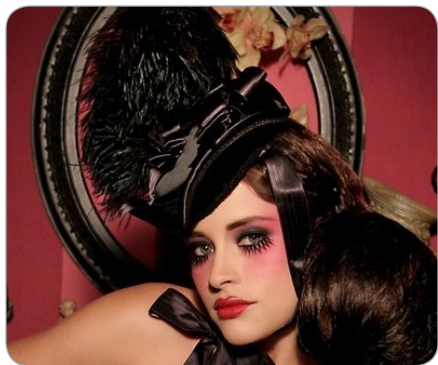
TOPSY TURVY DESIGN • TOPSYTURVYDESIGN.ETSY.COM Whimsical costume accessories for stage, screen & play.