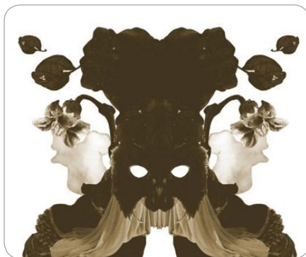
MIASMAH RECORDS • MYSPACE.COM/MIASMAH Music for scenes and places.