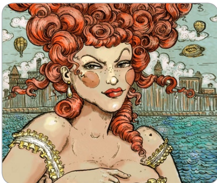
SCARLETT TAKES MANHATTAN • MOLLYCRABAPPLE.COM The new graphic novel by Molly Crabapple.