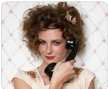
LOCHERS • LOCHERS.COM Sweet & sophisticated Parisian fashion label for those that also like it rough and dirty.