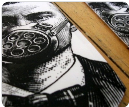
CYBEROPTIX TIELAB • CYBEROPTIX.COM Screenprinted silk and microfiber neckties + ascots. Ties that don't suck.