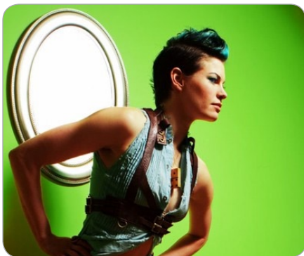
VON CLARET COUTURE • VENUSATHENAN.ETSY.COM Upcycled one of a kind bohemian steampunk clothing and accessories.